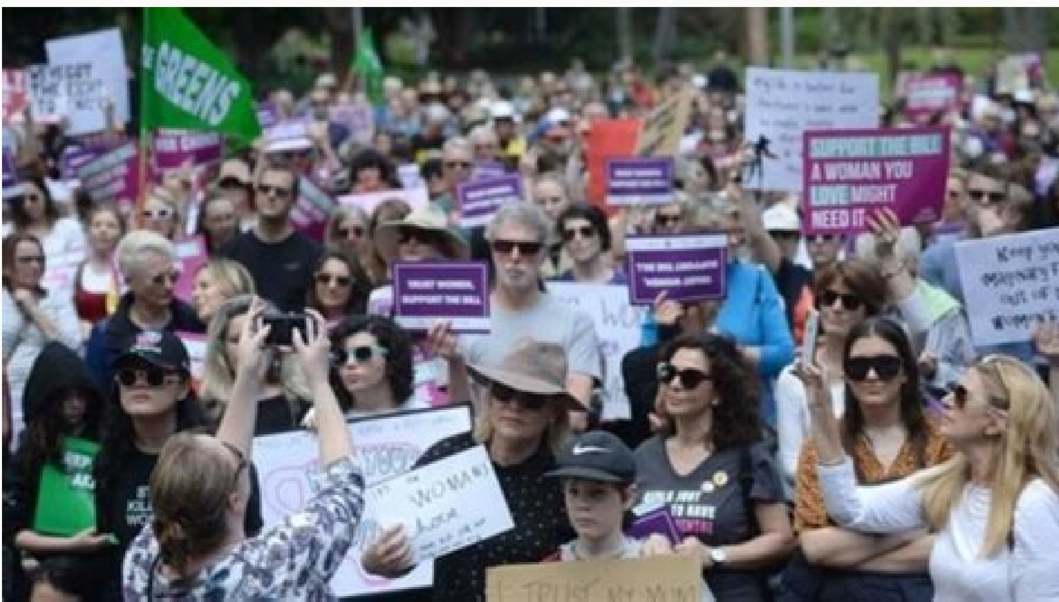
Are abortions legal in nsw. Abortion law reform act 2019 (nsw). Abortion law reform act 2019 s16 (nsw). When did abortion become legal in nsw.